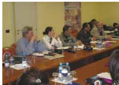
"Organic agriculture history, production, certification, inspection and accreditation" International training in Yerevan, Armenia

In Armenia, Azerbaijan, Georgia, the Kyrgyz Republic and Moldova, Avalon works together with its respective local project partners, EcoGlobe, GABA Agrobusiness Association, Elkana, ULGU and ProRural Invest, in the project Organic Agricultural Chain Development in the Southern Caucasus, Moldova and the Kyrgyz Republic. The project is funded by the Netherlands Foreign Ministry under its co-financing programme. The specific objective of the project is to establish structures for organic agriculture training, extension and production and also to develop outlets and to raise awareness among producers and consumers. The basis of the methodology is to