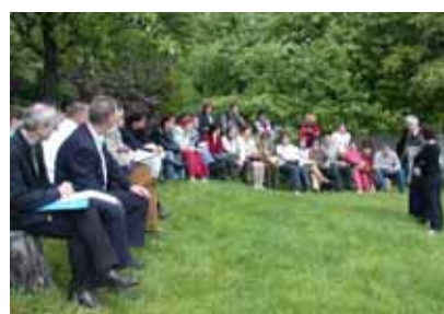
Network Meeting in Poland