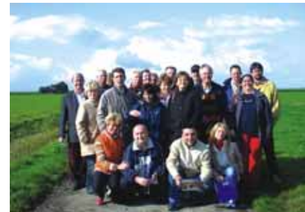
South East Europe project: visit to Holland

During 15 years of fruitful cooperation with many local organisations, the continuously growing number of contacts has developed into a lively and energetic network of more than 120 organisations that are active in the field of organic agriculture, nature conservation, biodiversity and sustainable rural development. Avalon developed a network programme, which creates synergy and motivates co-operation and new initiatives - it contributes to the common objective of all network members through an array of instruments: