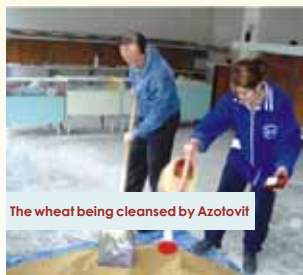
The wheat being cleansed by Azolovit

So far the members of the farmer group in Gandzakhar have been basically involved in vegetable production (green beans, cucumber, tomato, garlic, pepper, basil, and parsley) as well as in collection of wild berries. The products were mainly sold in the regional center; however the farmers find it possible to market part of the product in Yerevan where there is specialized store for organic products.