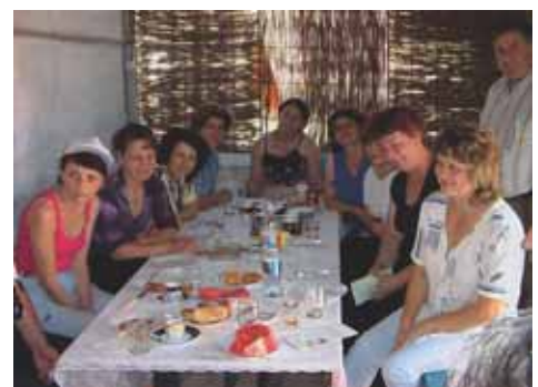
The members of the group hosting the representative of Bioterra Romanian Organic Farming Association

communication skills that are incomparable with what we had before: I think most of us are now able to uniquely combine tradition-keeping rural Armenian women with these new (sometimes the newest) business concepts and new knowledge. These skills are apparently useful in particular during the field days and seminars that we