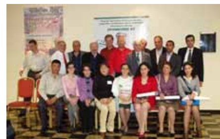
Participants of the training in Yerevan

coordinate the local partners' activities and planning in the participating countries and to create synergy. To enhance knowledge and skills, the project offers training, exchange visits, access to the Avalon Network and other forms of support. The partners have a considerable liberty to adjust activities to the situation in the country. The project focuses on the entire organic chain (hence the name). Themes include organic agriculture and certification, lobbying - both at policy making and public administration level - and involving businesses in production and marketing.