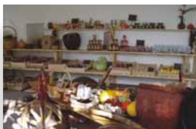
«Amour Koriz» the first organic shop in Armenia

In autumn 2006, through support from Shen NGO and financial assistance from EPER and SDC, the Organic Food and Consumers Association opened the first organic shop in Armenia - "Amour Koriz". The shop sells fresh and dried fruits and vegetables, herbs and nuts.