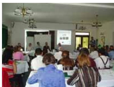
Network Meeting in Czech Republic

Combining forces and working together, Avalon helps local organisations to create solid sustainable rural communities.