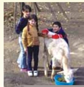
The first calf was born... Kids are always glad to help to take care of it

Hopefully, mother nature will be good to these hard working group of farmers by rewarding with abundant yields in the fall.