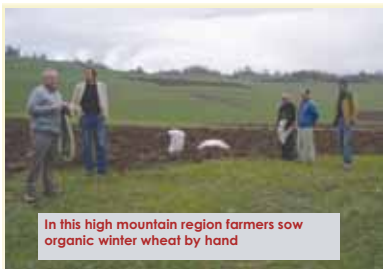
In this high mountain region farmers sow organic winter wheat by hand

the U.S. colleagues. However the ACDI/VOCA team sees the FFf program as being of benefit not only to the hosts but also to the volunteers.